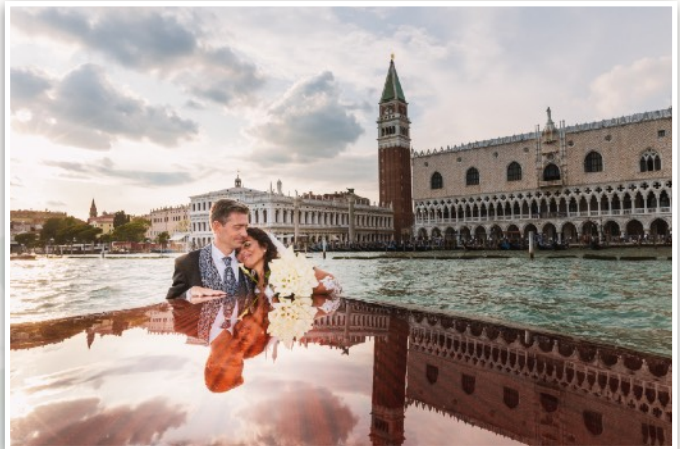
Foto Express can also cover your wedding with video and drone services, creating the Film of your wedding. We call it a Film because we create a script based on the events of your wedding day. We emphasize this because everything we produce is customized and not standardized according to your attitude and the event you are organizing.