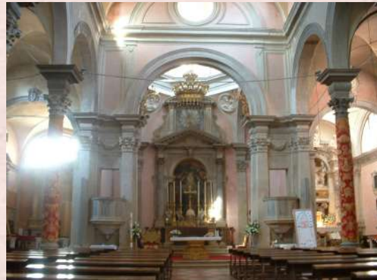
San Canciano Church

Distant from the hotel: 10 minutes by private water Taxi 15 minutes by Gondola 20 minutes walking